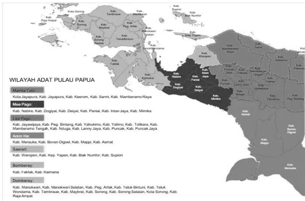
Image 1. Customary Territories of Papua Island

Source: id.scribd.com/aryonugroho93 and ITB Digital Library, 2019